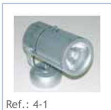
Ref.: 4-1 Base 70W Halogen Lamp