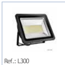
Ref.: L300 Projector LED LAMP 300W