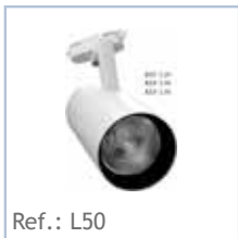
Ref.: L50 FIXED LED LAMP 50W