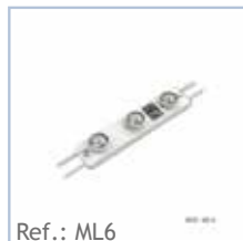
Ref.: ML6 MODULE BACKLIP LED 6W