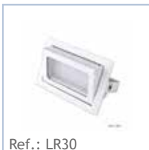
Ref.: LR30 FIXED RECTANGULAR LED LAMP 30W