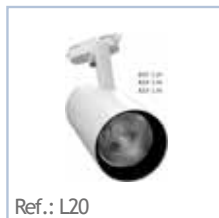
Ref.: L20 FIXED LED LAMP 20W