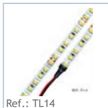
Ref.: TL14 STRIP LED 14W (L/M)