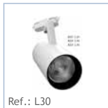
Ref.: L30 FIXED LED LAMP 30W