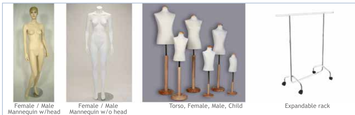
Female / Male Mannequin w/head