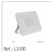
Ref.: LS100 Projector LED LAMP 100W