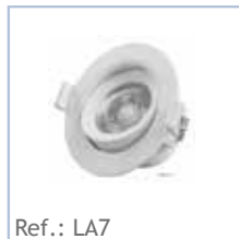
Ref.: LA7 FIXED DICHROIC RING LAMP 7W