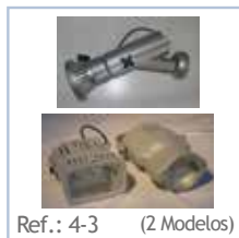
Ref.: 4-3 (2 Modelos) Halogen Lamp 150W Base and Riel