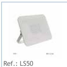
Ref.: LS50 Projector LED LAMP 50W