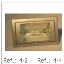
Ref.: 4-2 Ref.: 4-4 Fixed 70 W / 150 W Halogen Lamp