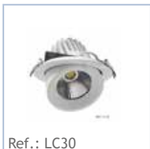
Ref.: LC30 FIXED RING LED LAMP 30W